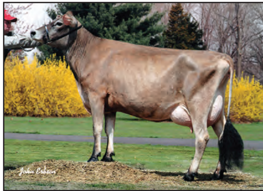
CROCKETT FARMS GOLDEN GLENNA-ET, VG-87% GREAT-GRANDAM OF LOT 150