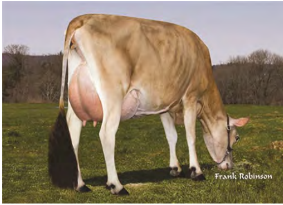
GABYS RENEGADE BLISSFUL, E-90% DAM OF LOT 26