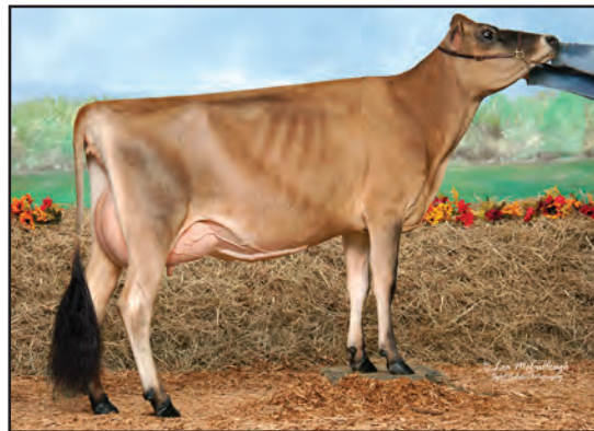
GORDONS NEVADA INDIGO, E-91% DAUGHTER OF SSF GOVERNOR IRIS (ABOVE)