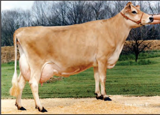
GABYS HERMITAGE ROXETTE, E-90% FOURTH DAM OF LOT 29