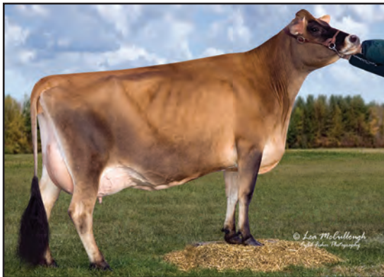
GORDONS BT MINDY, VG-87% SISTER TO LOT 81