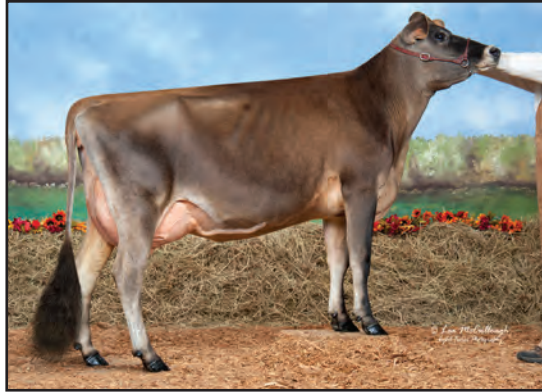
SSF PRESTIGE ICE, VG-87% DAM OF LOT 82