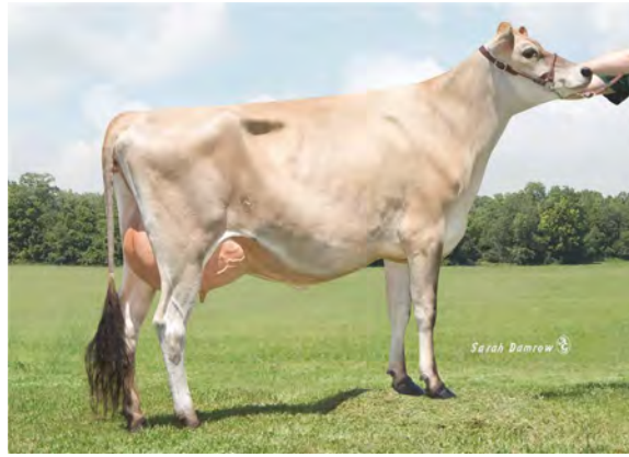
GORDON SULTAN BIANCA, E-91% GRANDAM OF LOT 79