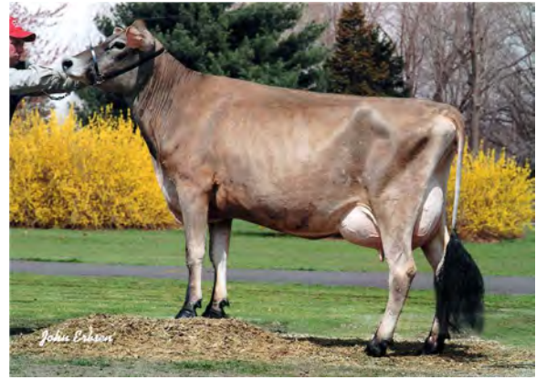
CROCKETT FARMS GOLDEN GLENNA-ET, VG-87% FOURTH DAM OF LOT 151