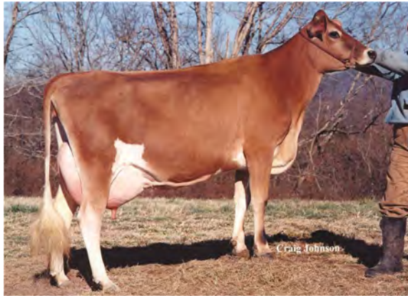
GABYS IATOLA AQUAMARINE-ET, VG-88% FOURTH DAM OF LOT 23