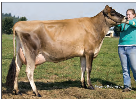
CASCADIA JACE MADISON, VG-87% SISTER TO THE GRANDAM OF LOT 141