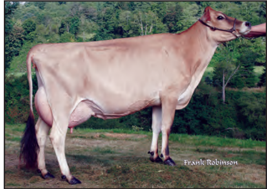
SUNSET CANYON CENTURION MAID, E-91% FOURTH DAM OF LOT 161