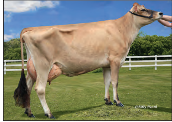
THREE VALLEYS TBONE C MAYBELL-ET, E-90% GRANDAM OF LOT 161