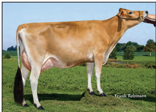
GABYS VITO ALICIA, E-90% SISTER TO THE GRANDAM OF LOT 158