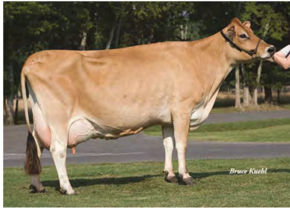
BERRYS DANIEL MINDI, E-90% GREAT-GRANDAM OF LOT 8