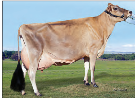
ARETHUSA VERIFY PEANUT, E-94% GRANDAM OF LOT 180