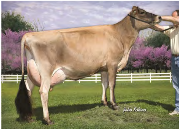
DAVE-RON IATOLA SYLVIA-ET, VG-87% GREAT-GRANDAM OF LOT 131