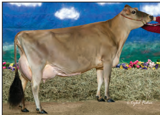
COWBELL COUNCILLOR PRALINE, E-94% GREAT-GRANDAM OF LOT 180