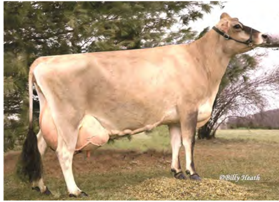
ANSELL ACRES BERRETTA DAHLIA, E-93% SISTER TO THE DAM OF LOT 167