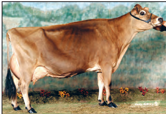
AVONLEA D JUDE KARMEL, E-94% FOURTH DAM OF LOT 164