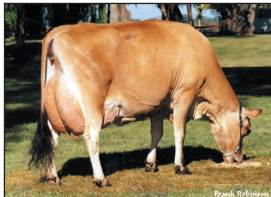
GOLDEN MBSB OF TWIN HAVEN-ET, E-94% FOURTH DAM OF LOT 150