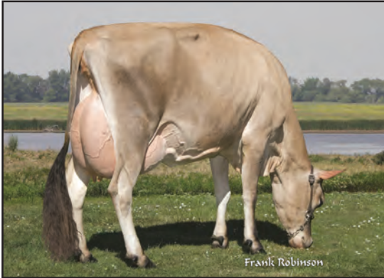
THREE VALLEYS COUNTRY MAID 3-ET, VG-85% GREAT-GRANDAM OF LOT 161