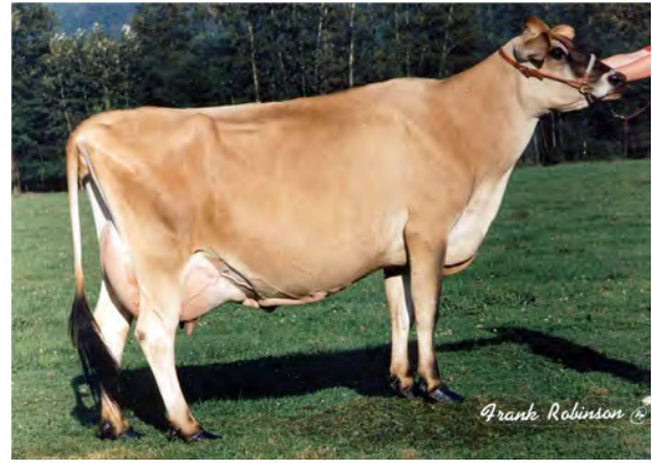
STARHEART DUNCAN ALPHA, EX-2E (CAN) FIFTH DAM OF LOT 75