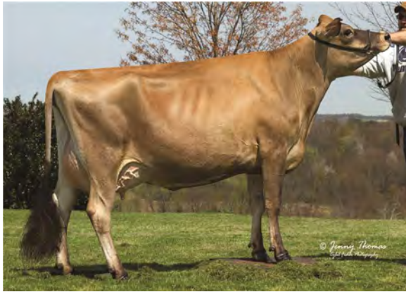
RATLIFF RES KASHMIR-ET, E-90% GREAT-GRANDAM OF LOT 168