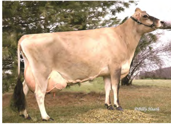
ANSELL ACRES BERRETTA DAHLIA, E-93% FOURTH DAM OF LOT 101