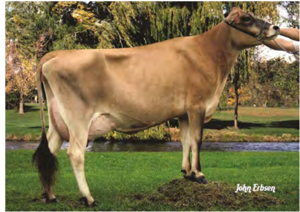
NOBLEDALE VICTORIAS SYDNEY-ET, E-90% FOURTH DAM OF LOT 131