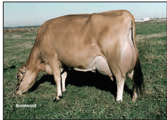
BW BERRETTA PRIZE G525, E-92% GREAT-GRANDAM OF LOT 72