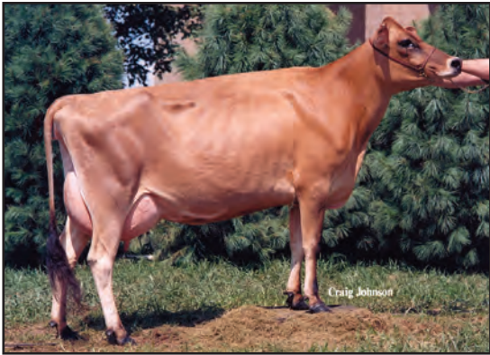
GORDONS SAMBO MAGGIE, E-91% SISTER TO LOT 81