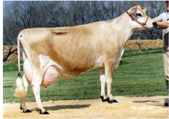
GABYS BOOMER ROXY {6}, E-91% FOURTH DAM OF LOT 36