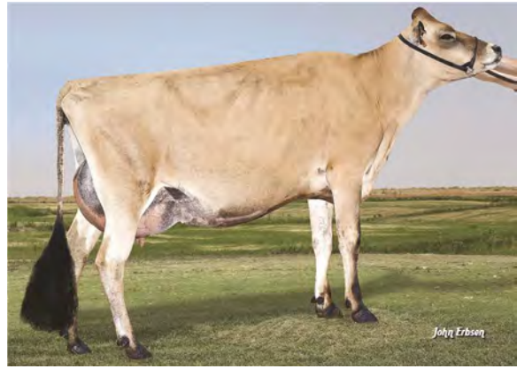
GOFF COLTON 22416-ET, VG-87% SISTER TO THE DAM OF LOT 139