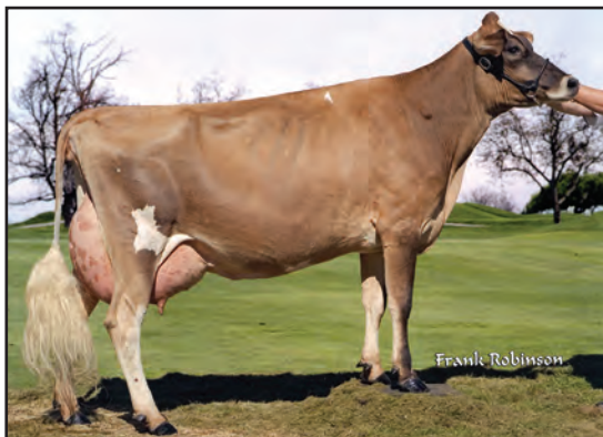
CASCADIA HALLMARK MANNER, E-90% GREAT-GRANDAM OF LOT 141