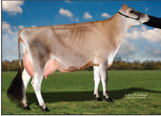
HER-MAN FASTRACK MEAGAN-ET, E-91% SISTER TO THE DAM OF LOT 161