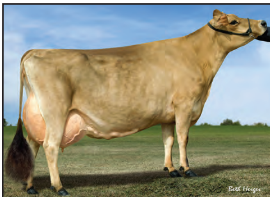
HILL TOP ACE MORGAN, E-90% GREAT-GRANDAM OF LOT 162