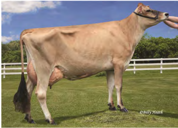
THREE VALLEYS TBONE C MAYBELL-ET, E-90% GRANDAM OF LOT 142