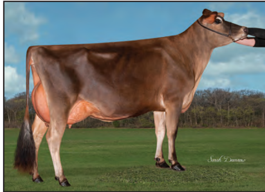
MEAD-MANOR TEQUILA PRYIA, E-91% SISTER TO LOT 180