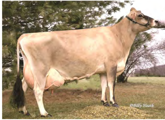
ANSELL ACRES BERRETTA DAHLIA, E-93% SISTER TO THE GRANDAM OF LOT 163