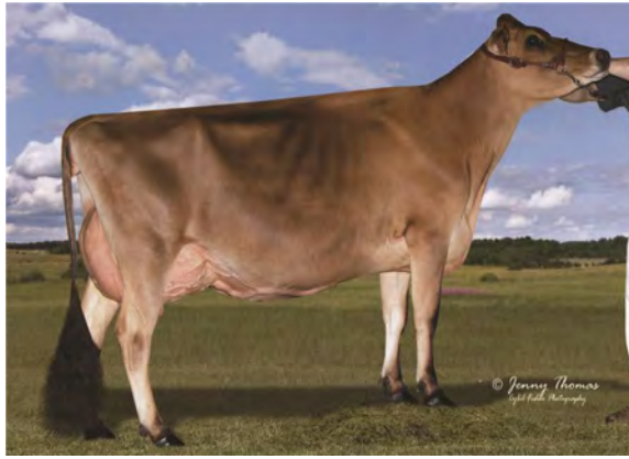
GORDONS COMERICA CHOCOLATE, E-91% SISTER TO LOT 74