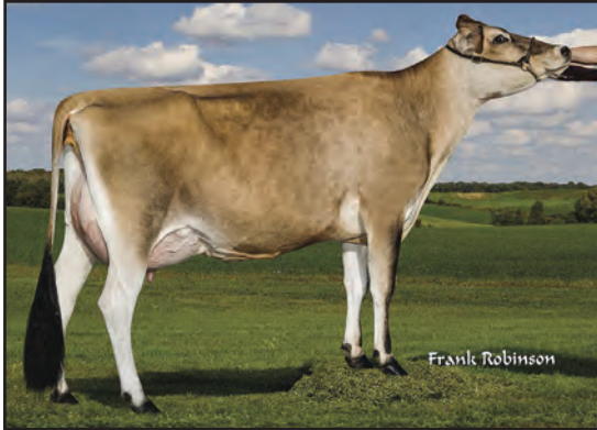
BW METALICA GALIANA Y554-ET, VG-88% FULL SISTER TO LOT 72