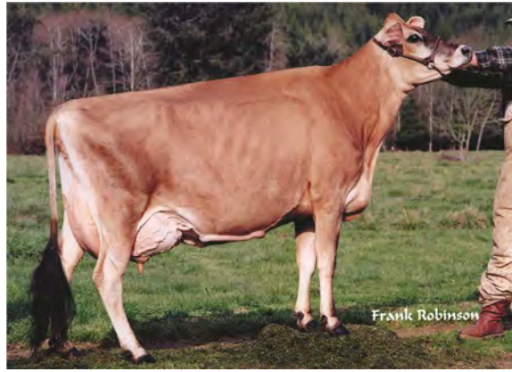
GF LIBERTY DANIELLE, E-91% GREAT-GRANDAM OF EMBRYO