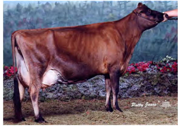
ENNISKILLEN TITLE GROVE, SUP-EX 94-3E (CAN) FOURTH DAM OF LOT 182