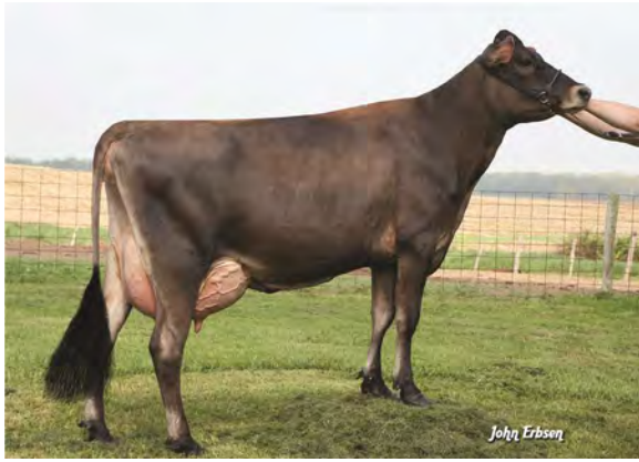
GOLDEN BRAZO GLENITA {6}-ET, VG-87% GREAT-GRANDAM OF LOT 151