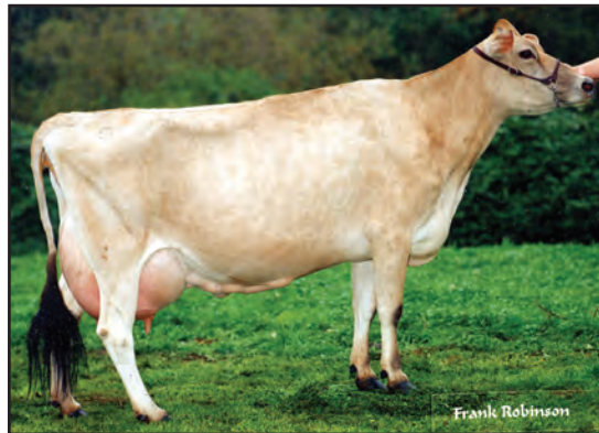
TENN HAUG E MAID, E-93% FOURTH DAM OF LOT 159