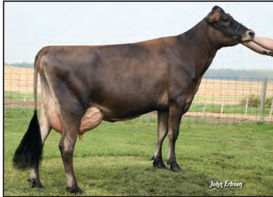
GOLDEN BRAZO GLENITA {6}-ET, VG-87% GRANDAM OF LOT 150