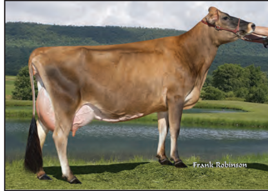
GABYS BLACKSTONE ANGELINA, E-92% SISTER TO THE DAM OF LOT 29