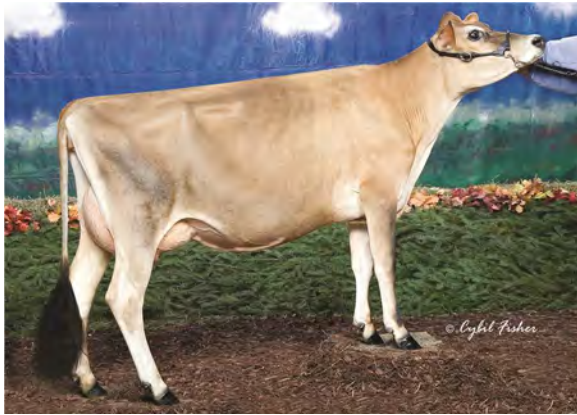
JEMI JADE MERRI-P, E-90% GRANDAM OF LOT 191