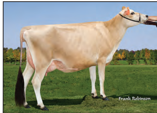
HOMETOWN LEGAL ARIEL-ET, EX 90 (CAN) SISTER TO THE DAM OF LOT 29