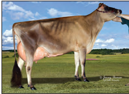
SSF GOVERNOR IRIS, E-93% SISTER TO THE GRANDAM OF LOT 82