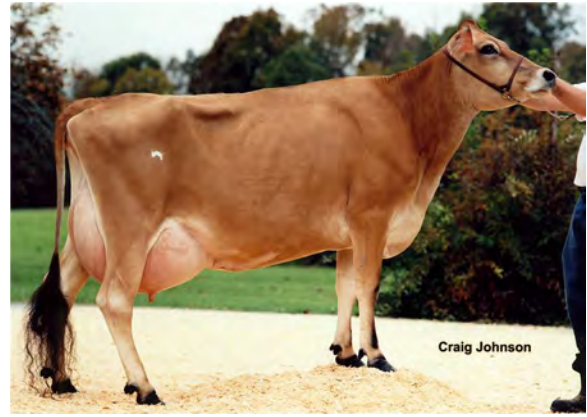
GABYS RUEBEN BLONDIE, E-90% FOURTH DAM OF LOT 26