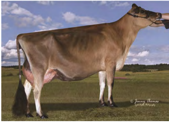
GORDONS EXCALIBUR ALICE, E-92% DAM OF LOT 75