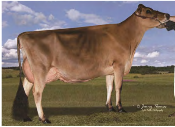
GORDONS COMERICA CHOCOLATE, E-91% SISTER TO THE GRANDAM OF LOT 78