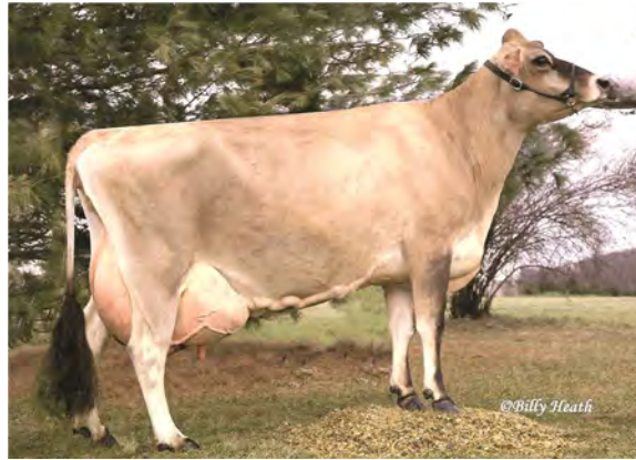
ANSELL ACRES BERRETTA DAHLIA, E-93% GRANDAM OF LOT 166