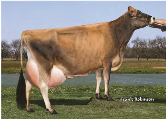
GABYS JEWELER AMYRILLIS-ET, E-91% GREAT-GRANDAM OF LOT 22