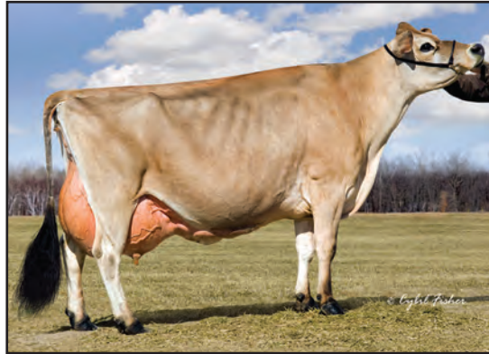
RATLIFF F PRIZE KANSAS-ET, E-95% GREAT-GRANDAM OF LOT 164