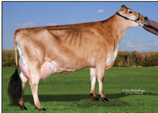
GABYS MEDALIST ALYMPIAN, E-91% DAM OF LOT 158