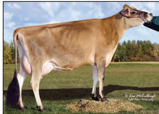
GORDONS RESSURECTION MILADY, VG-88% SISTER TO LOT 81