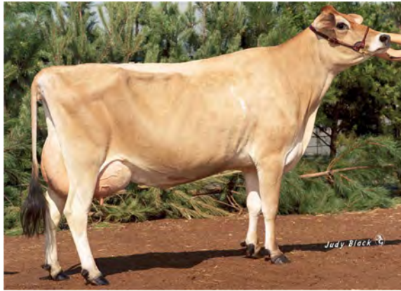
STONEY HOLLOW BROOK MICKY, E-92% FOURTH DAM OF LOT 144