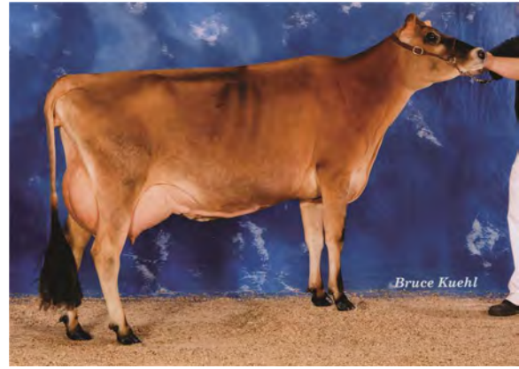
SSF VINDI, E-92% GRANDAM OF LOT 76