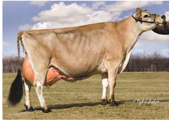
RATLIFF F PRIZE KANSAS-ET, E-95% FOURTH DAM OF LOT 168