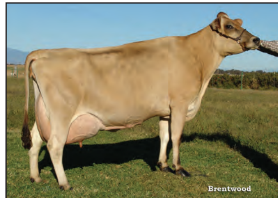
BW CENTURION ENID K783, E-94% SISTER TO THE DAM OF LOT 72