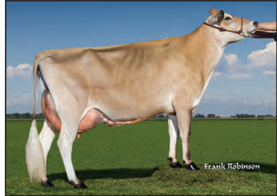
BW LEGION GALIANA ET629-ET, E-94% DAM OF LOT 72