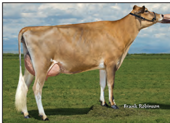
CASCADIA IATOLA MAJESTIC-ET, E-92% SISTER TO THE GRANDAM OF LOT 141