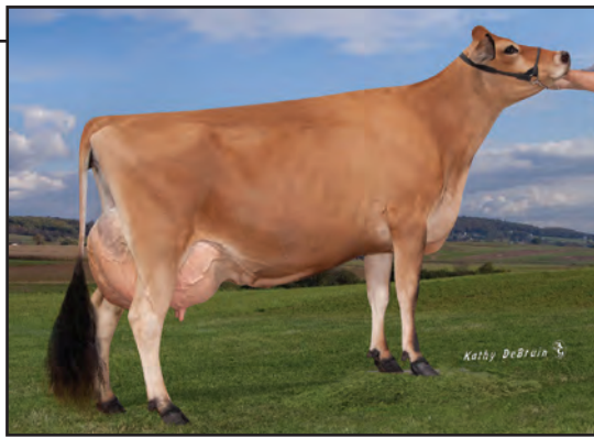
HI-LAND ZIPPER FLUFFY, VG-84% DAM OF LOT 5