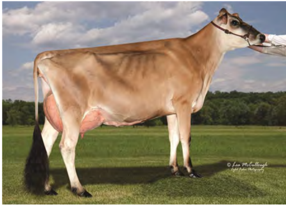
GORDONS ACTION VICTORIA, E-91% DAM OF LOT 76