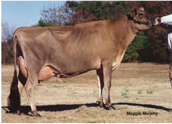
FREEDOM PETAL, E-94% GRANDAM OF LOT 139