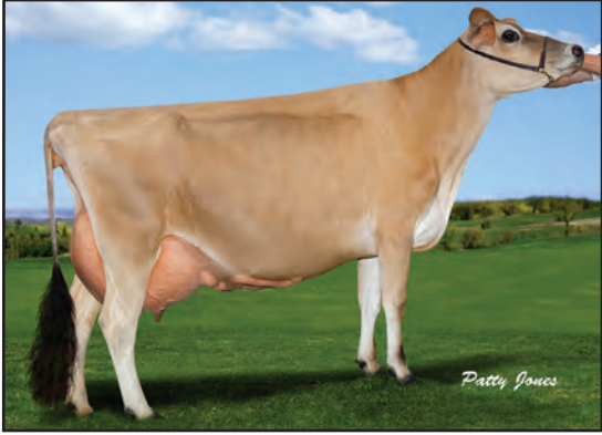
GABYS ARTIST AMBROSIA, E-94% GRANDAM OF LOT 29