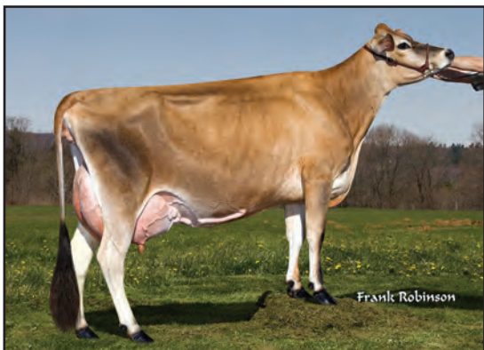
GABYS VALENTINO ANNALISA-ET, E-90% SISTER TO THE GRANDAM OF LOT 158