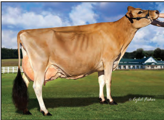
GABYS JACINTO ALYSSA, E-93% SISTER TO THE DAM OF LOT 29