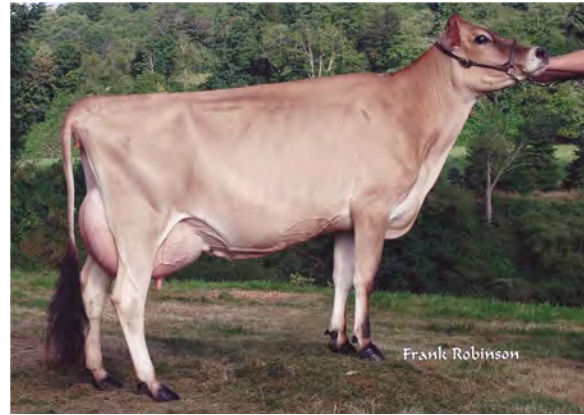
SUNSET CANYON CENTURION MAID, E-91% FOURTH DAM OF LOT 142