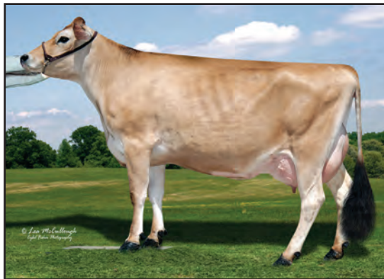
NORSE STAR RENEGADE MARLEY, VG-83% SISTER TO THE DAM OF LOT 160