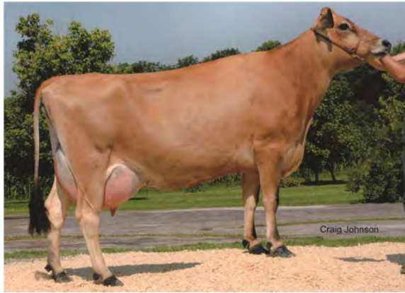
GABYS ACTION MICKA, E-91% GRANDAM OF LOT 25