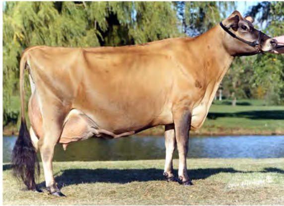
WAYMAR PATRICK NADINE, SUP-EX 97-6E (CAN) FOURTH DAM OF LOT 130