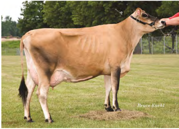
AMERI MILK JACE TAMARA, E-94% SISTER TO THE GRANDAM OF LOT 140