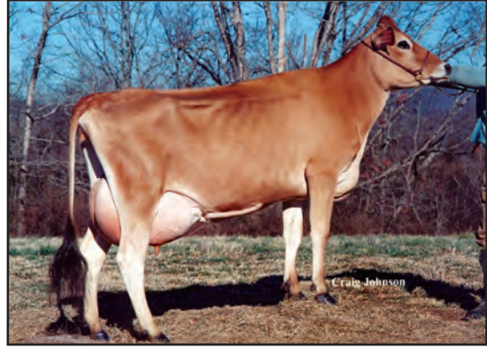
GABYS IATOLA AMETHUST-ET, E-90% GREAT-GRANDAM OF LOT 29