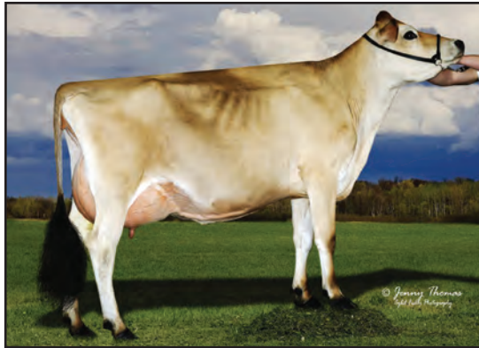
HEARTLAND IRWIN MYRA-ET, VG-88% DAM OF LOT 162