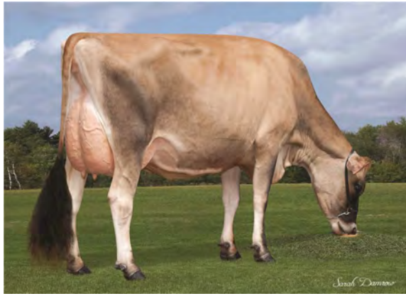
CLARESHOE ALL STAR ZOOM ZOOM, E-91% FROM THE SAME MATERNAL LINE AS LOT 56