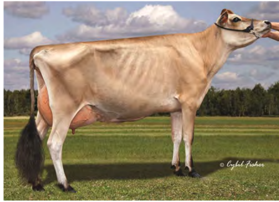
ANSELL ACRES VINTAGE DEWDROP, E-91% SISTER TO THE DAM OF LOT 102