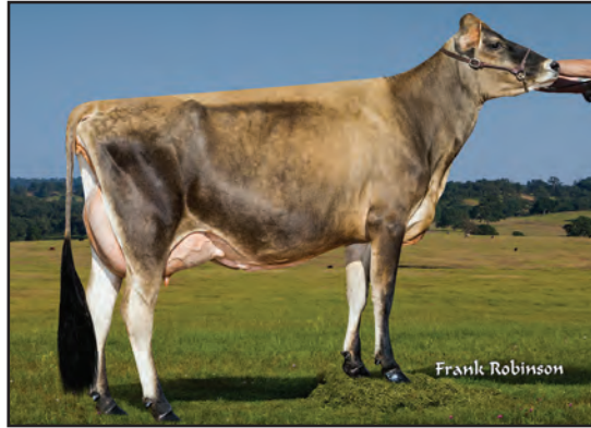
NORSE STAR TOPEKA MIDNIGHT-ET, E-90% DAM OF LOT 160