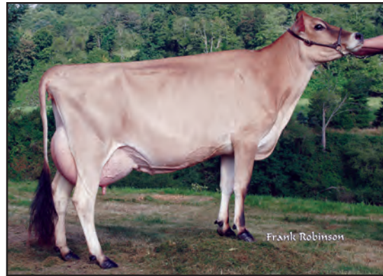
SUNSET CANYON CENTURION MAID, E-91% GREAT-GRANDAM OF LOT 159