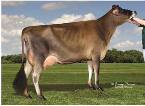
SSF RAPTOR CHIANTI, E-90% GRANDAM OF LOT 80