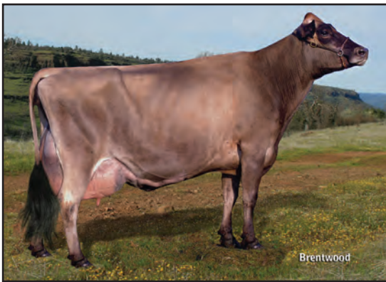
BW AVERY KATIE ET121-ET, E-93% GRANDAM OF LOT 72