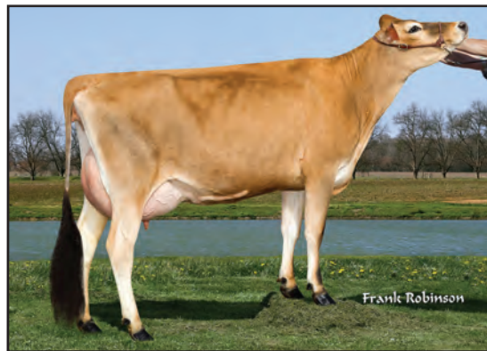
GABYS CHAMP AMANDA-ET, E-90% SISTER TO THE GRANDAM OF LOT 158