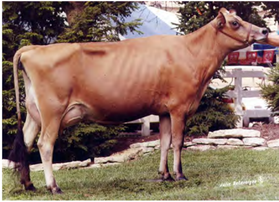
ENNISKILLEN MCT GROVE III-ET, E-93% GREAT-GRANDAM OF LOT 182