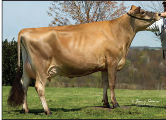
RATLIFF RES KASHMIR-ET, E-90% GRANDAM OF LOT 164