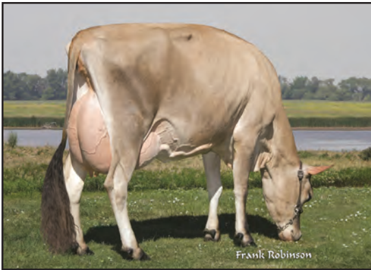
THREE VALLEYS COUNTRY MAID 3-ET, VG-85% GRANDAM OF LOT 159