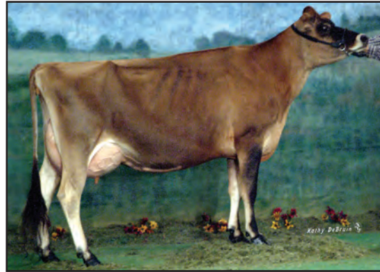
GORDONS REMAKE MONIQUE, E-91% SISTER TO LOT 81