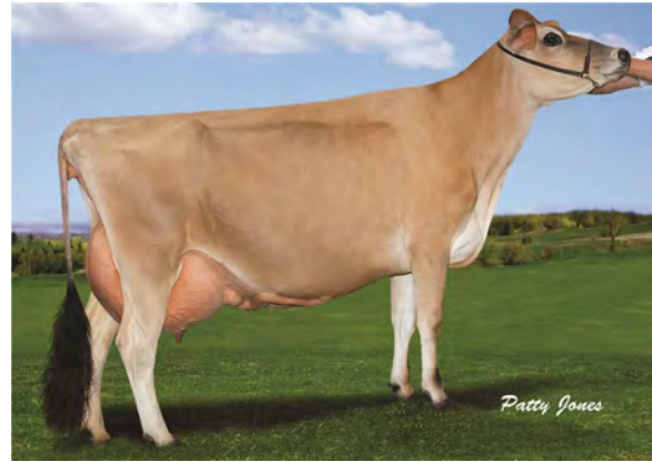
GABYS ARTIST AMBROSIA, E-94% FOURTH DAM OF LOT 22