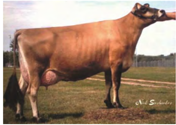
DEBCOTT JADE TAHOE, E-92% GREAT-GRANDAM OF LOT 140