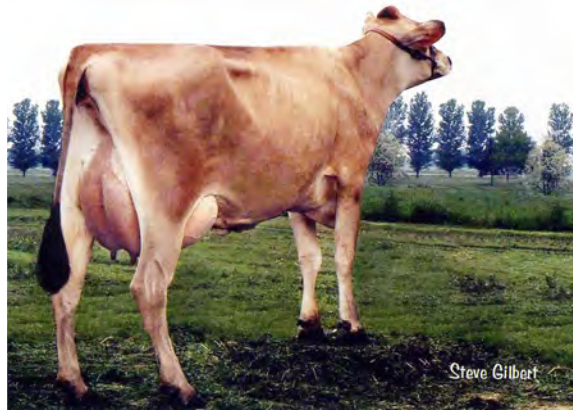
CANTENDO MANNIX MISTI, VG-87% SISTER TO THE GREAT-GRANDAM OF LOT 109