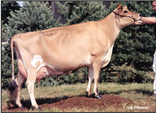
MISS GLITTER WOMAN, E-93% DAM OF LOT 81