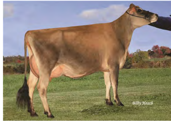
JEMI JAMMIN MARY-P, E-92% SISTER TO THE DAM OF LOT 191