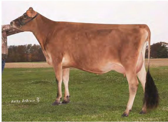
ORTHRIDGE VALENTINO VANNA-P, VG-87% DAM OF LOT 136