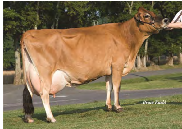
BERRYS PARADE MEDLEY, E-91% FOURTH DAM OF LOT 8