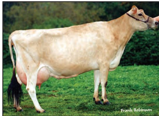
TENN HAUG E MAID, E-93% FIFTH DAM OF LOT 161