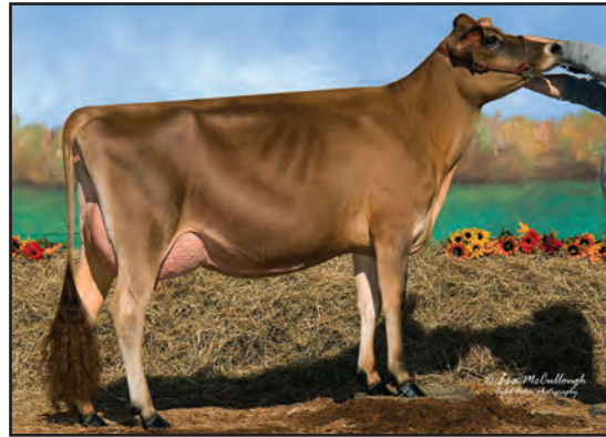
GORDONS JADE MISS-ET, E-92% SISTER TO LOT 81